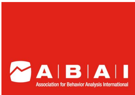
Association for Behavior Analysis International

Rebuilding Opportunity and its endorsers believe that a long-term nationwide effort to reduce concentrated disadvantage and increase opportunity in America's neighborhoods is vital to the future of the nation. Together, we urge action at the federal level and at the local level that focuses on reducing poverty, inequality, and discrimination and increasing the implementation of policies and programs that help families thrive.